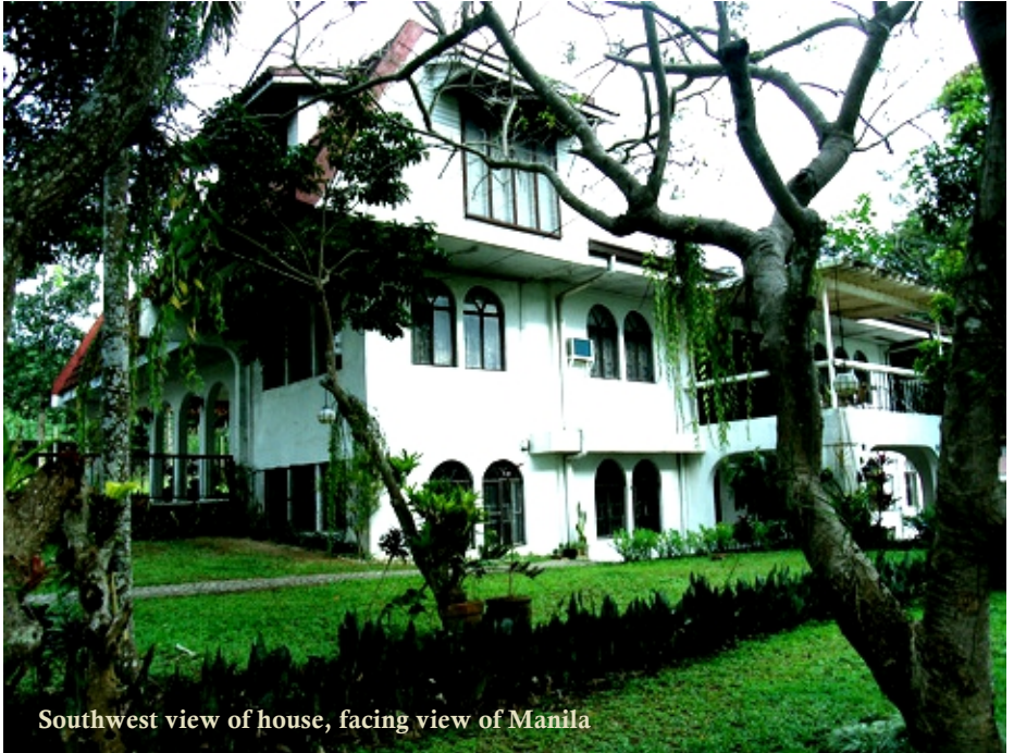
Southwest view of house, facing view of Manila