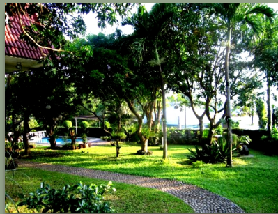
Backyard and swimming pool

Designed for entertaining in a large scale, the spacious backyard garden with a good-sized swimming pool surrounded by exotic tropical plants and large shady trees (fruits of the green-thumb owner's labor) offers a relaxing summer getaway.